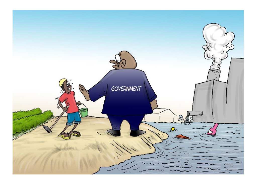
Figure 2. Illustration based on research conducted in the area. Farmers feel that the government is criminalising the cultivation of vegetables rather than responding to unlawful pollution upstream.

instead of criminalising the cultivation of vegetables, local government authorities should stop unlawful wastewater discharges upstream (see Figure 2).